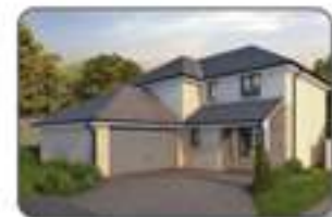
Luxury 3 and 4 bed Family Villas