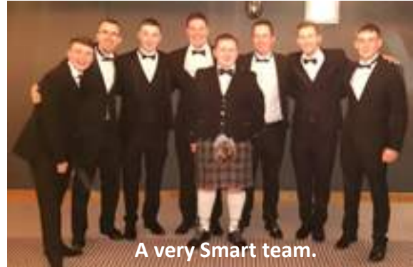
A very Smart team.

In a relatively short time, the Smart brothers have progressed their father's company extremely well and deserve the full support of the Burntisland community in their future endeavours.