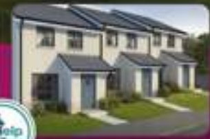
3 bed Starter Homes

A small private community of 2, 3 and 4 bed