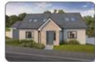
2 and 3 bed Bungalows and Cottages