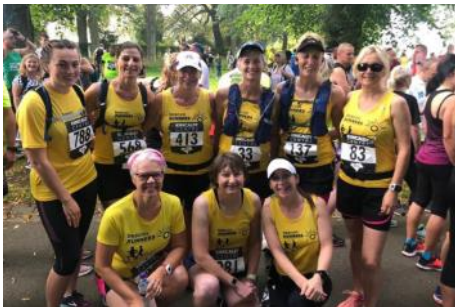
Looking forward to the Kirkcaldy Half Marathon