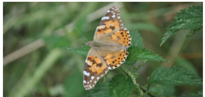
Vanessa Cardui - The Painted Lady

The Walking Group continues to meet on the first Wednesday of each month during the winter and walks last approximately two hours. If you would like to join the group, please get in touch by phone 01592 891330 or via email info@craigencalttrust.org.uk .