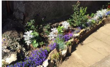
Allan Court Blossom

There have been further developments at Allan Court. Led by one of our volunteers and a few others, we have added perennial planting up the side of the sheltered housing complex.