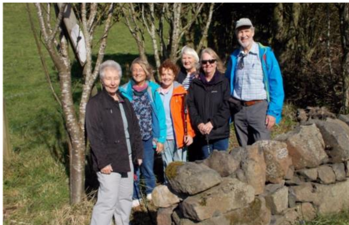
The Walking Group at the new path entrance

Anyone who has experienced this steep and bendy hill just beyond the entrance to Craigencalt Farm, will appreciate what a safety benefit this new path will be. This new path through the trees will complete a circular route around Craigencalt which offers splendid views of the coast and inland areas. All this has been made possible by the superb cooperation of the Trust, landowners, users and council working together.